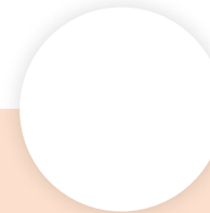
Recruitment in process